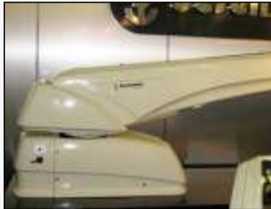
Standard Buccaneer Marine Hydraulic Davit