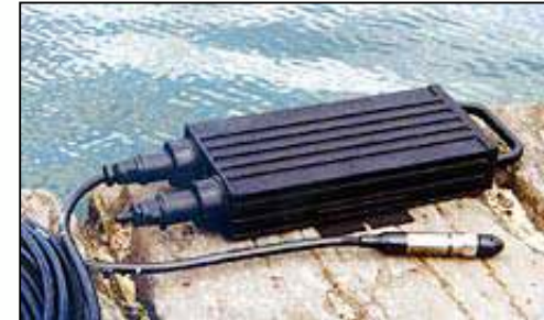
Standard Buccaneer Portable Tide/Water Level Recorder