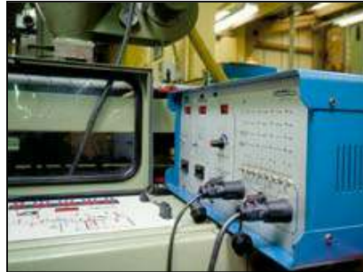
Mini Buccaneer CNC Controller