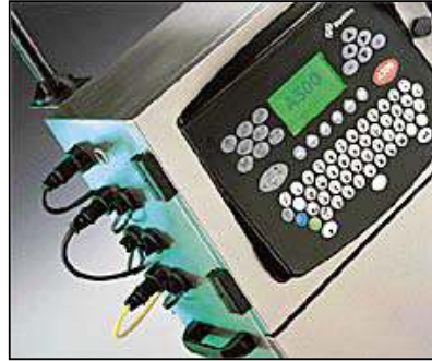
Standard Buccaneer Food Processing Printer