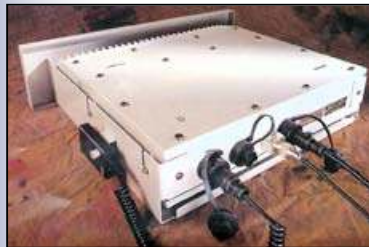
Standard Buccaneer Multi band Comms System