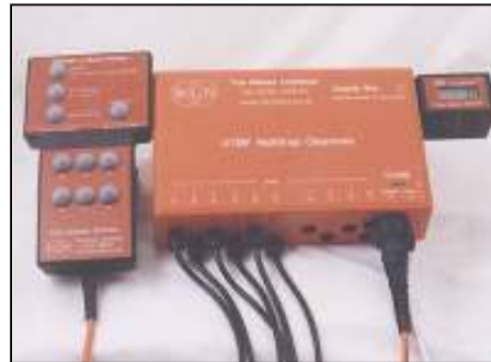
Standard Buccaneer Clay Pigeon