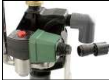
Mini Buccaneer Water Pump