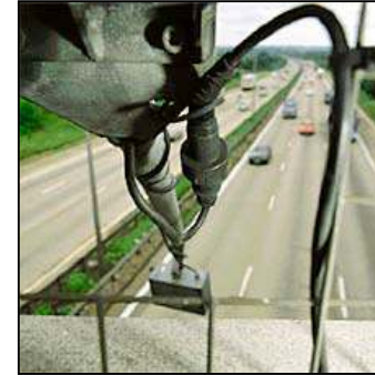
Standard Buccaneer Traffic Flow Sensors