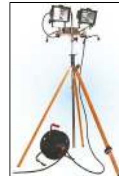
Standard Buccaneer Fire Safety Equipment