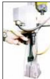
Standard Buccaneer Pre-configured industrial entry/exit control system