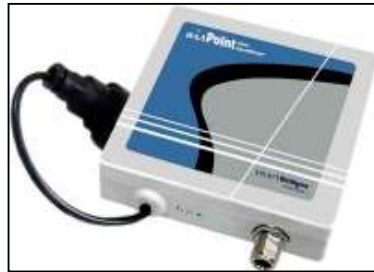
Standard Buccaneer Network Link