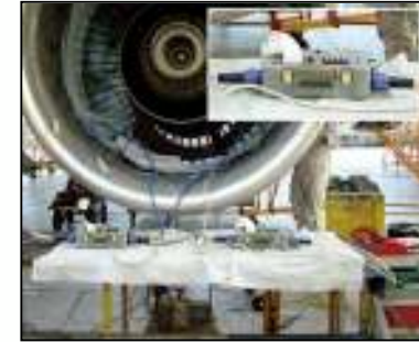
900 Series Buccaneer Jet Engine Diagnostic Device