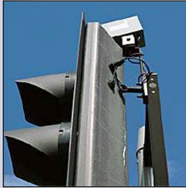
Standard Buccaneer Traffic Signal Control