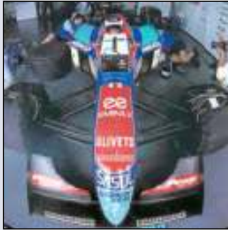
Standard Buccaneer F1 Tyre Warmers