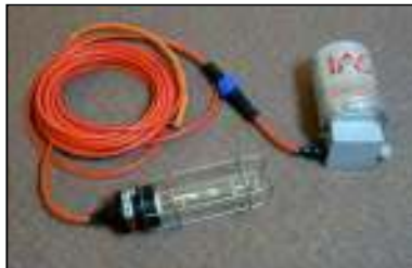
900 Series Buccaneer Marina power connection