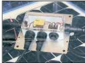
Standard Buccaneer Solar Power Controller