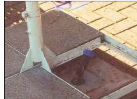
900 Series Buccaneer External Lighting