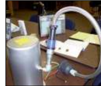
900 Series Buccaneer Water Pump