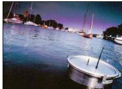
Standard Buccaneer Navigation