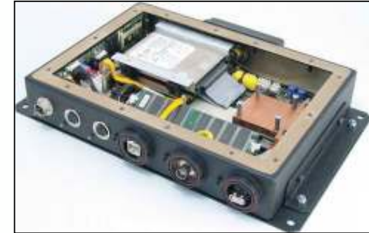
Ethernet, USB and Standard Buccaneer Ruggedised PC