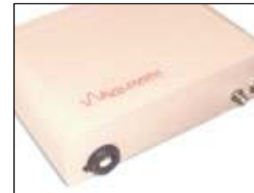
Ethernet Buccaneer Communication Equipment