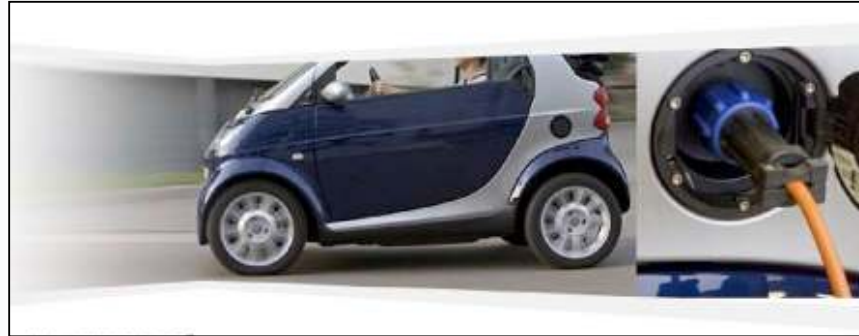
900 Series Buccaneer Smart Car prototype