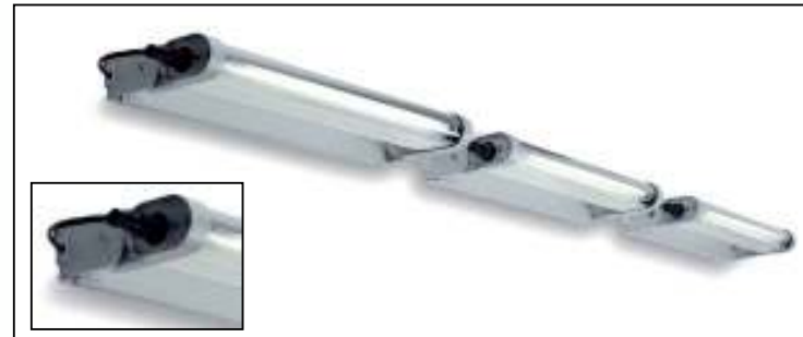
Mini Buccaneer Strip Light Unit