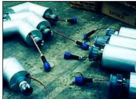
900 Series Buccaneer Hot and cold modular water supply