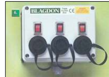
Standard Buccaneer Distribution Unit