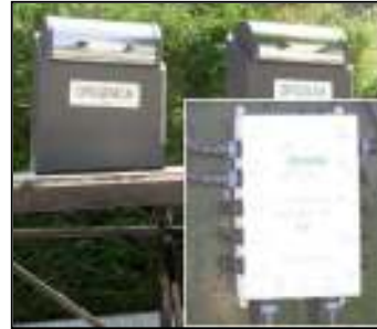
400 Series Buccaneer Electronic Control for Lifting Device