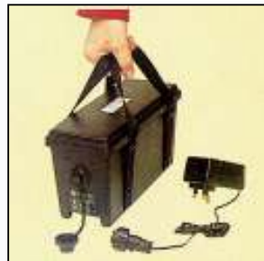
Buccaneer Connector Portable Power Pack