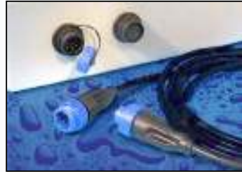
Buccaneer 400 Series Overmould