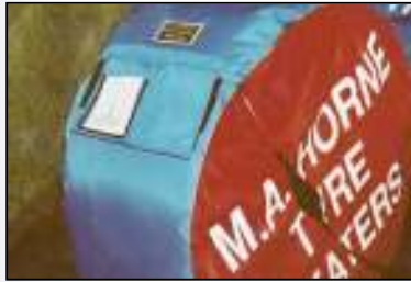
Standard Buccaneer Tyre Warmers