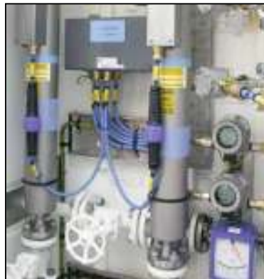
900 Series Buccaneer Gas & Oil Sampling System