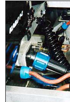
900 Series Buccaneer Rail Inspection Vehicles