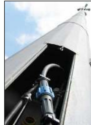
900 Series Buccaneer Flood Lighting Towers