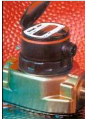
Mini Buccaneer Remote Reading Water Meter