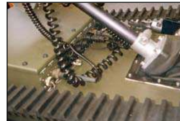
Standard Buccaneer Remote control bomb disposal