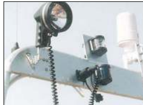
Standard Buccaneer Marine