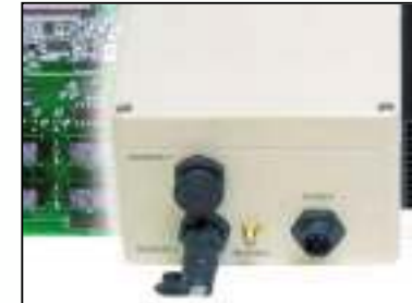
400 Series Buccaneer Wireless Communications device