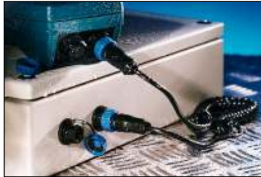
Buccaneer 400 Series