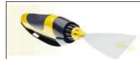
Mini Buccaneer Barnacle Scraper