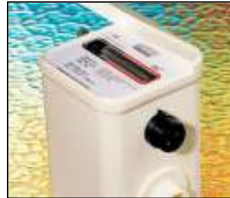
Mini Buccaneer Water Meter