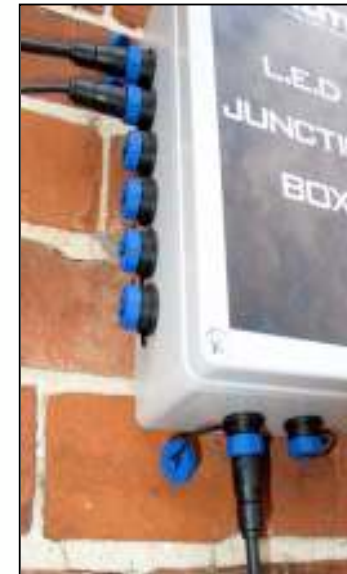
Buccaneer 400 Series LED Junction Box