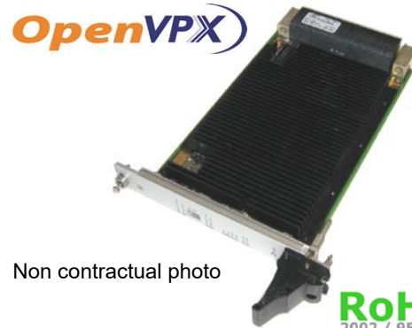
Non contractual photo

In order to meet High Performance Embedded Computing systems (HPEC) requirements, the Interface Concept software suite makes the integration of the IC-INT-VPX3d together with the IC FPGA (IC-FEP-xxx), switch (Cometh) and carrier boards easy.